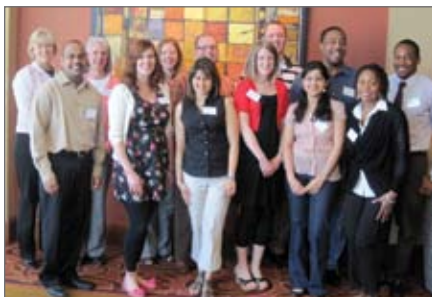
The newest College of Public Health alumni are all smiles at the new graduate brunch.

to the December 2010 and May 2011 graduating classes, which have increased membership more than 50 percent. To capitalize on this success and bring members together, the chapter hosted its second annual new graduate brunch on April 30 at the Hilton Omaha. Twenty College of Public Health alumni and their guests attended.