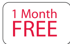
One month membership at the UNMC Center for Healthy Living unmc.edu/cfhl