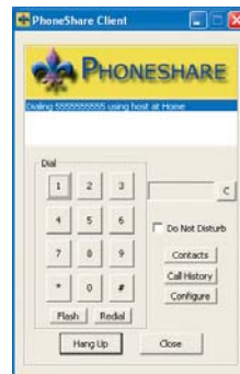
Software turns a PDA into an Internet phone.