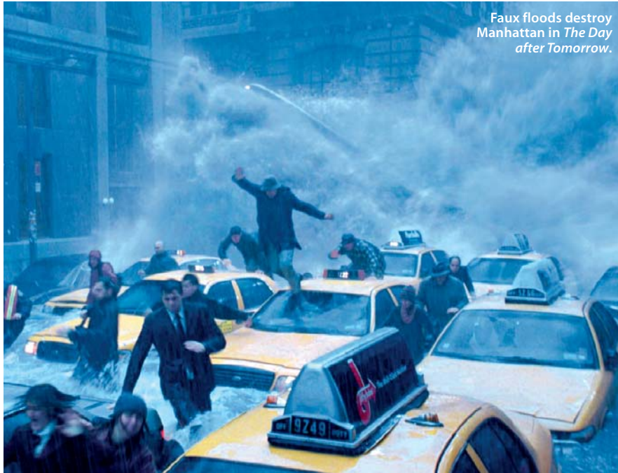
Faux floods destroy Manhattan in The Day after Tomorrow .