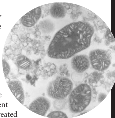
Mitochondria are key targets for drugs.