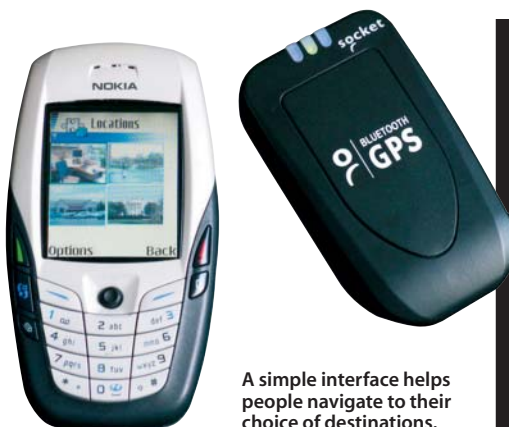
A simple interface helps people navigate to their choice of destinations.