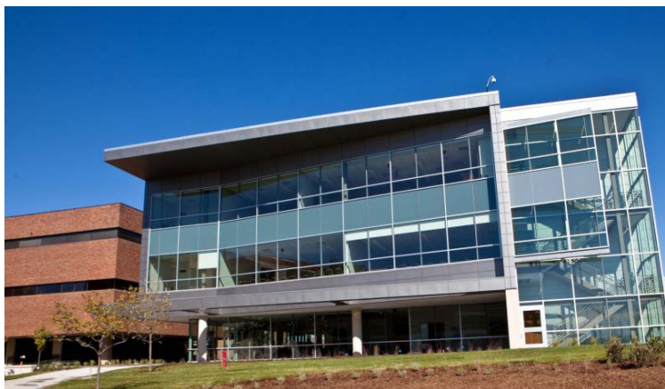
Center for Nursing Science Building Omaha, Nebraska Dedicated on October 13, 2010