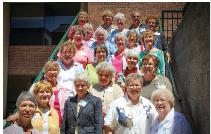
Class of 1962

For more information about the College of Nursing Alumni Association, please visit www.unmc.edu/alumni or www.facebook.com/unmcNURSINGalumni .