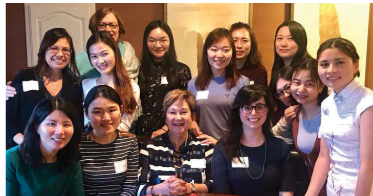
International students having dinner with the Dean

2 continents, 5 countries, and 6 Universities worldwide