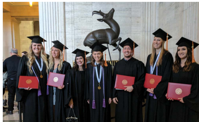
Accelerated BSN graduates, Lincoln, Dec., 2017

The Visionary Leadership in Education Award recognizes an individual who has demonstrated the ability to skillfully establish or administer an education initiative or role at UNMC or a national organization.