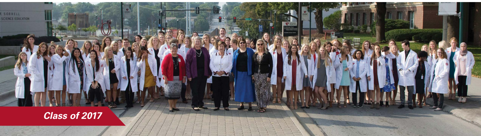
Class of 2017