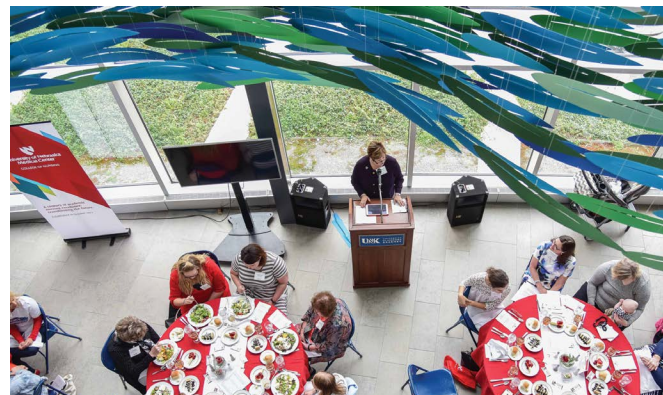
Kearney 40th Anniversary