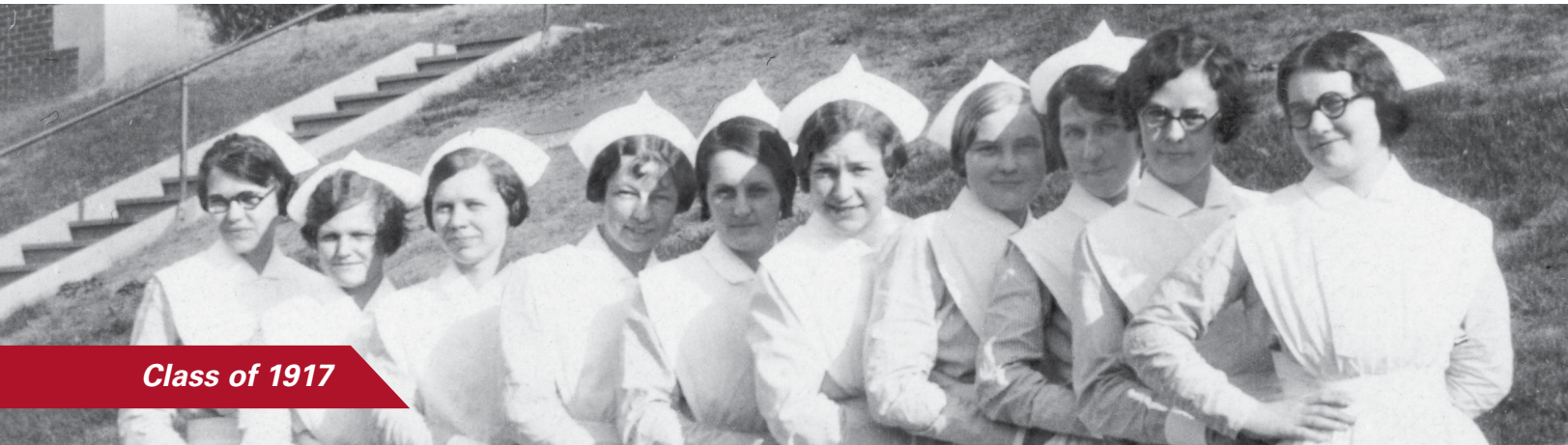
Class of 1917