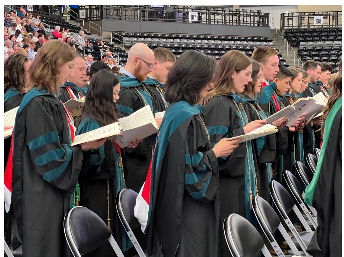
Members of the UNMC Physical Therapy Program's Class of 2023 on Friday, May 5, 2023.