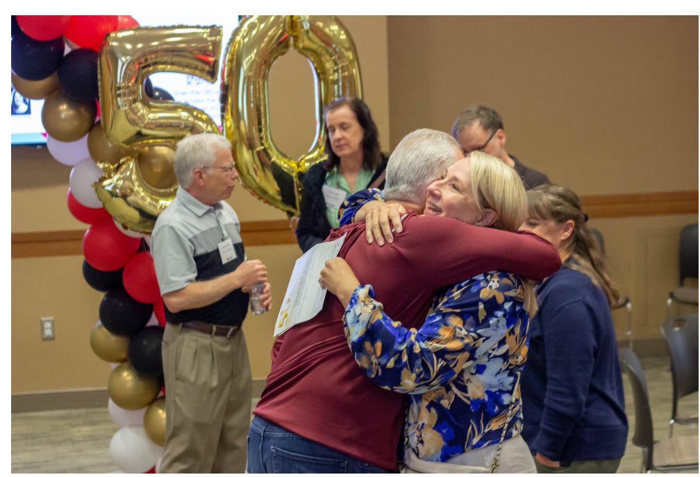
UNMC PT alumni greet each other on Saturday, April 28, at the program's 50th reunion

Summer highlights from UNMC's Physical Therapy Program