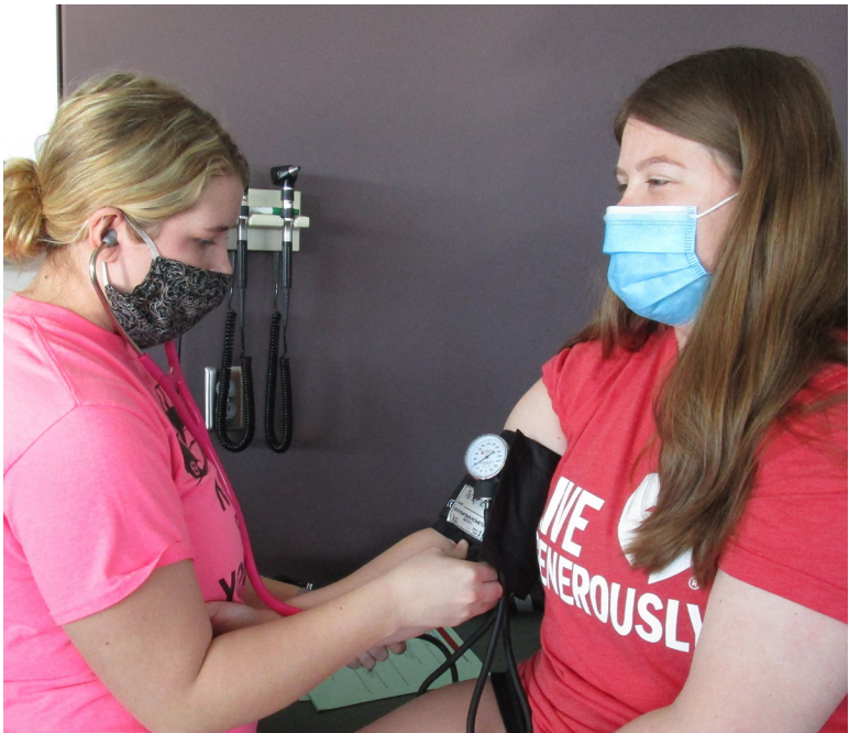
Students participate in Clinical Skills Vital Signs lab on the Kearney campus.