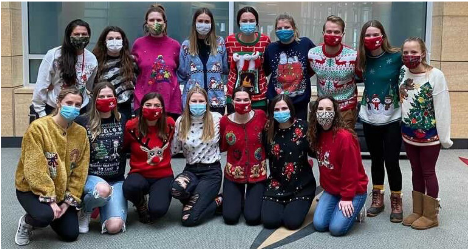
Despite COVID restrictions, students in Omaha were still able to participate in the Annual Ugly Christmas Sweater event.