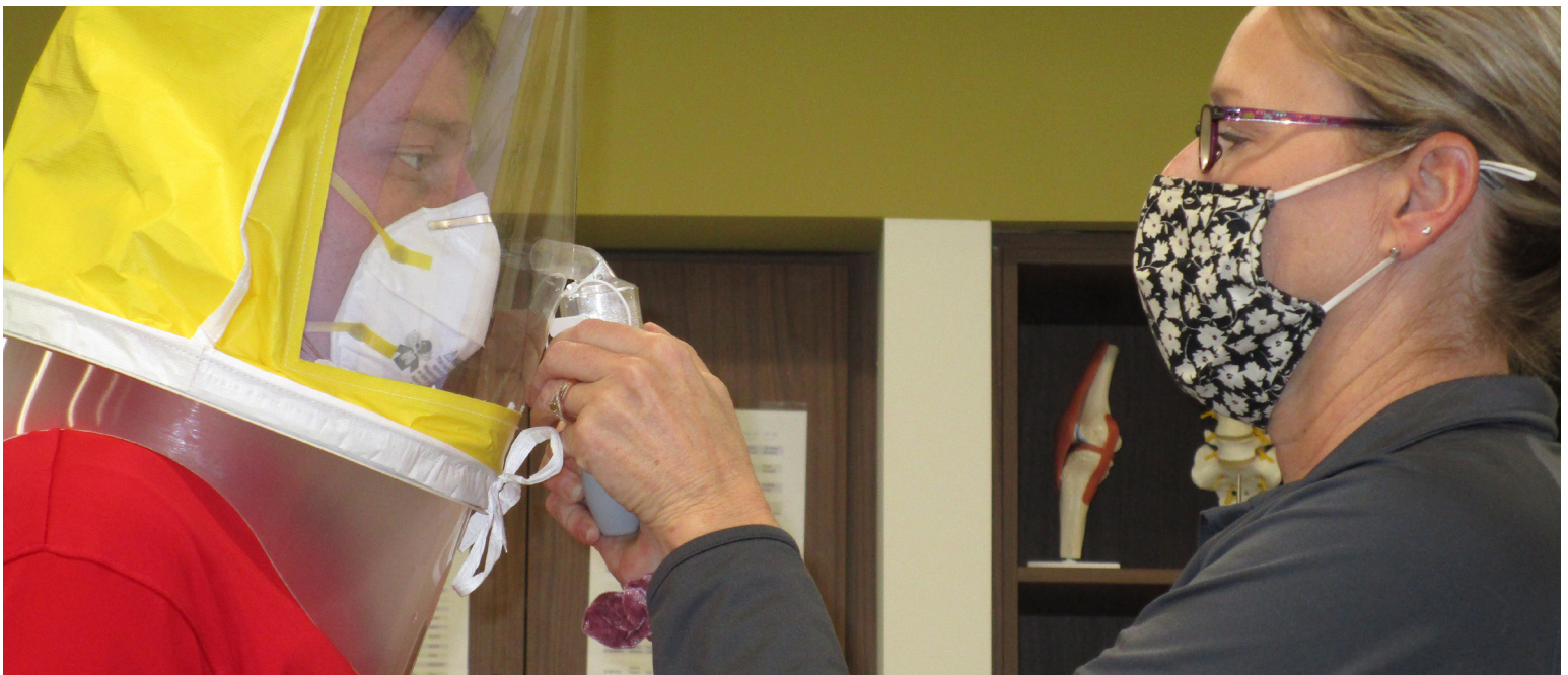
Respirator Fit Testing Clinic at the Health Science Education Center in Kearney