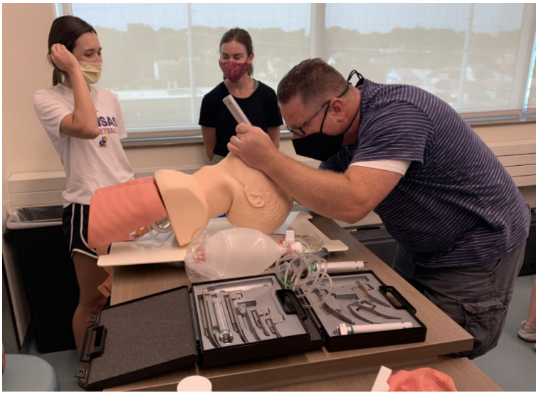
Students practice intubation skills during an airway management training session on the Omaha campus.