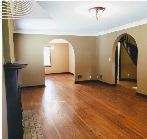
Wood Floors | Large Rooms