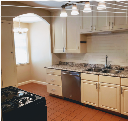
Updated Kitchen | Breakfast Nook