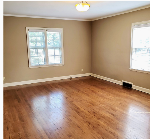
Vintage Bathrooms | Charming