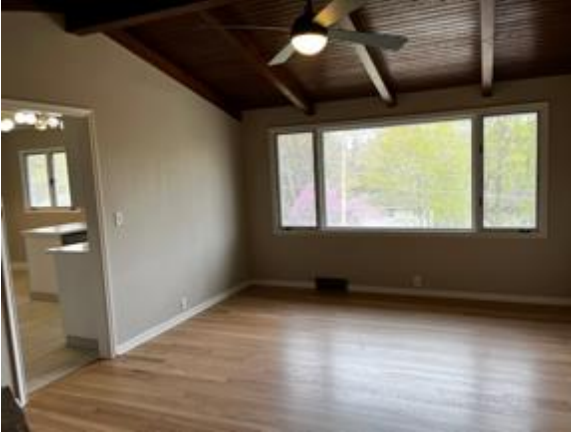
Kitchen/Breakfast nook/Main level laundry