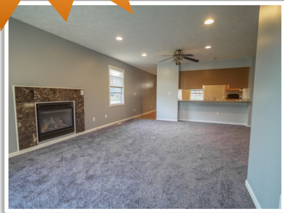
Upstairs living room with gas fireplace

Within walking distance of Creighton & UNMC. Only a five-minute drive into Historic downtown Omaha and one of the top 5 Zoo's in the world, Henry Doorly Zoo.