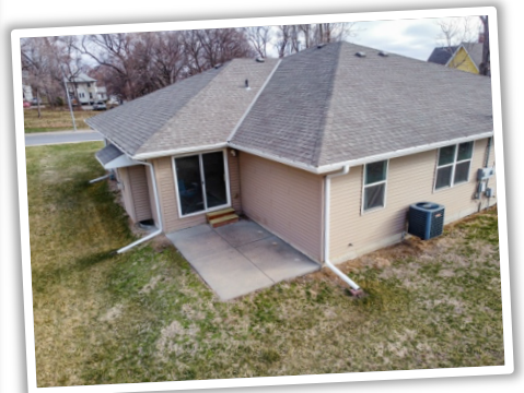
Back patio with space for a BBQ grill

2815 Caldwell St. Omaha - rileym21@gmail.com