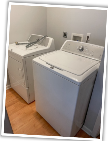
Dedicated laundry room on main level with washer / dryer included (new in 2021)