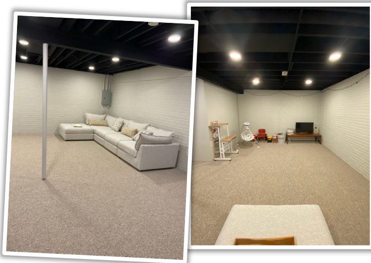
Large downstairs living / playroom