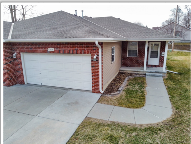
Attached two-car garage and a large driveway for extra parking