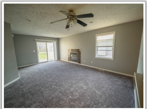
Living room with sliding door to backyard patio

2815 Caldwell St. Omaha - rileym21@gmail.com