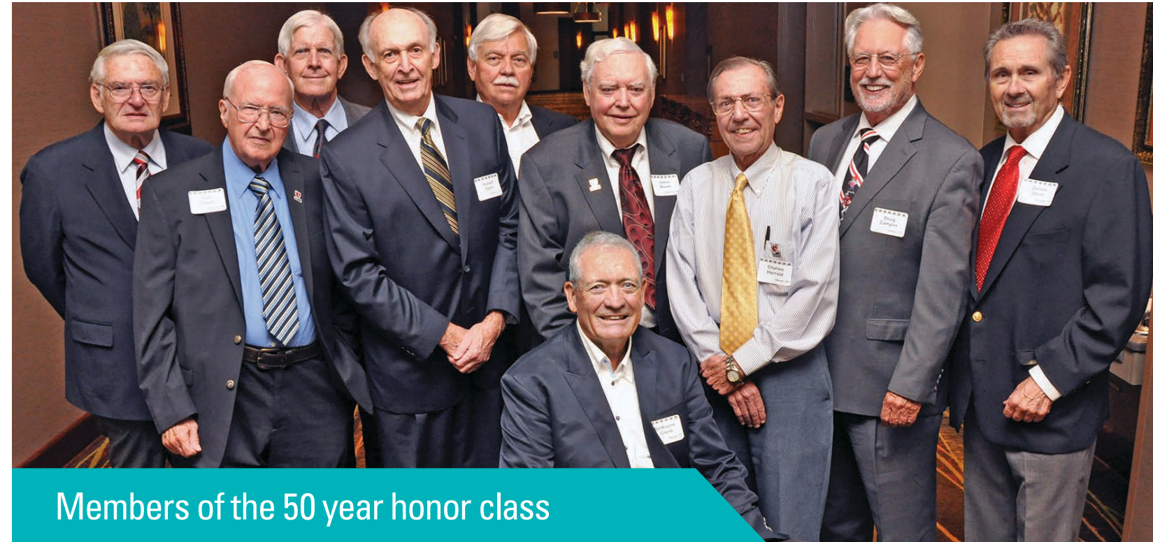
Members of the 50 year honor class

The UNMC College of Dentistry celebrated the Alumni Reunion with numerous, well-attended events. From the Dean's Club and Alumni Reunion Banquets to the continuing education course and the Dental Hygiene Program 50th Anniversary events, alumni gathered to reminisce, learn and celebrate one another's accomplishments.