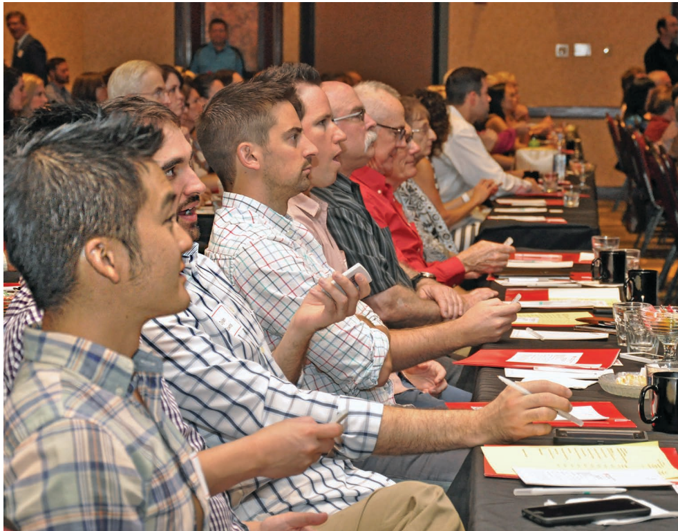
Continuing Education course presentation