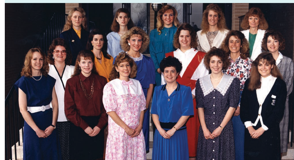
Pictured above is the dental hygiene class of 1983. At left is the class of 1990.