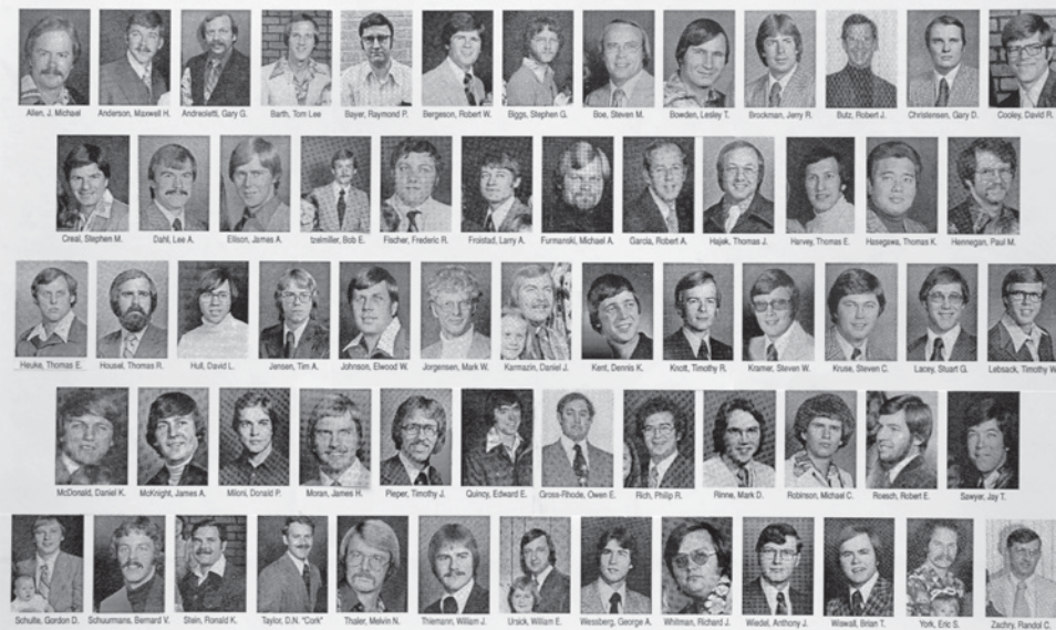
Class of 1976 composite photo taken from the yearbook.