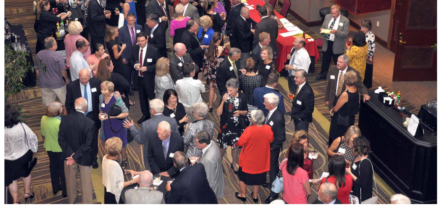
College of Dentistry alumni gather at the Embassy Suites in Lincoln for the 2017 Alumni Reunion.