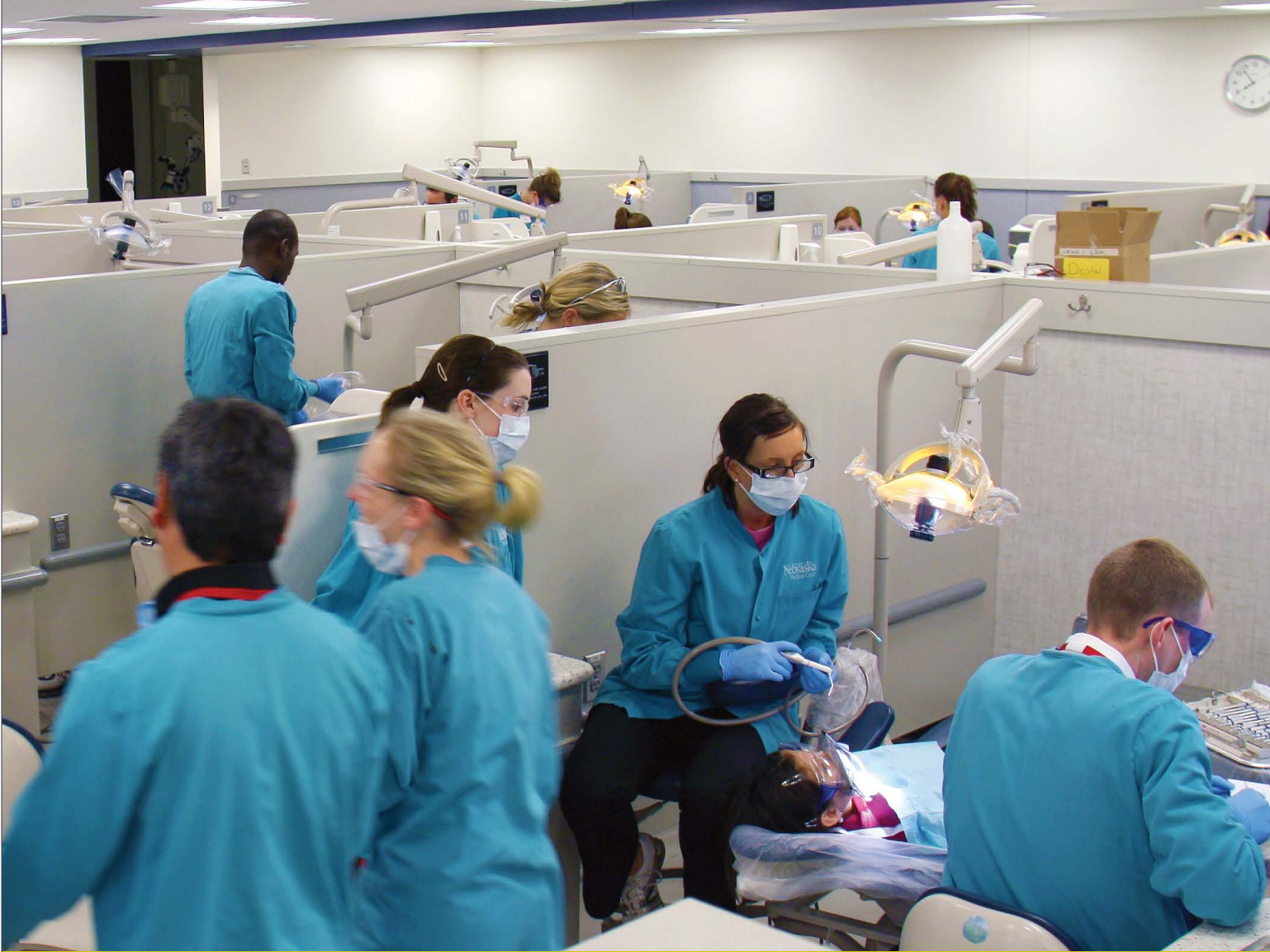
A busy night at the Sharing Clinic