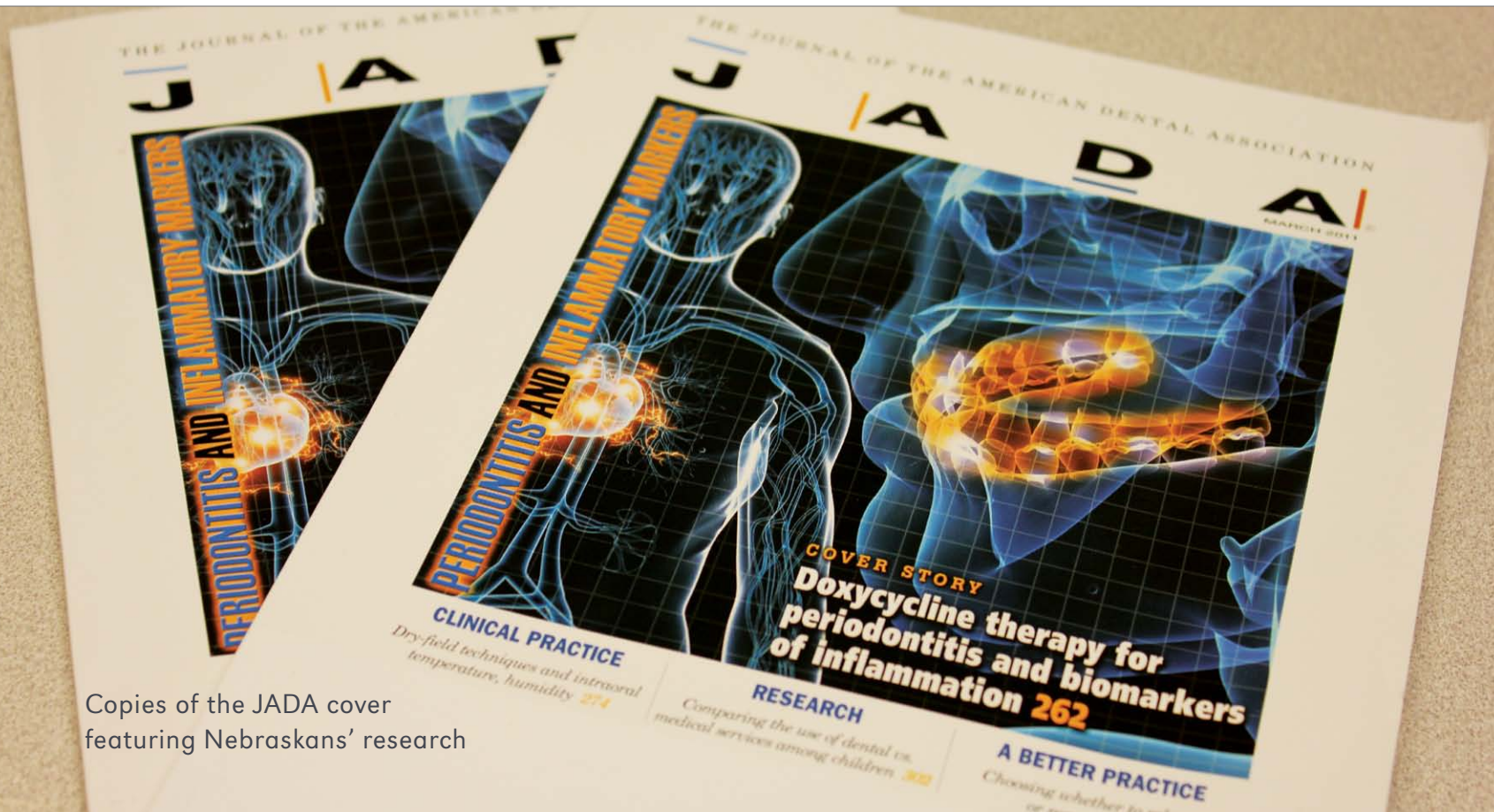
Copies of the JADA cover featuring Nebraskans' research