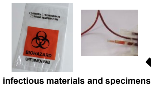
infectious materials and specimens