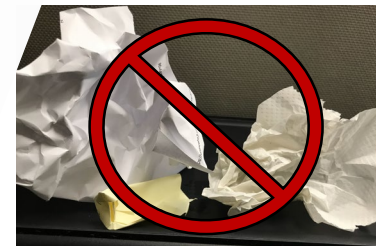
office paper and garbage

Questions? Contact EHS. (402) 559-6356 www.unmc.edu/ehs