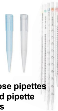
loose pipettes and pipette tips