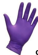
contaminated disposable PPE