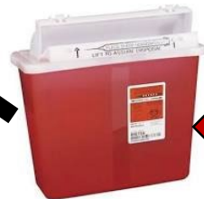
disposable, closed sharps containers