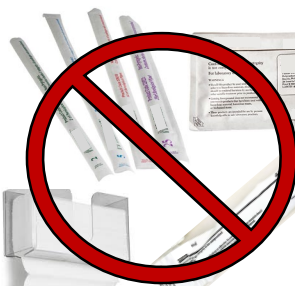
uncontaminated packaging and paper towels