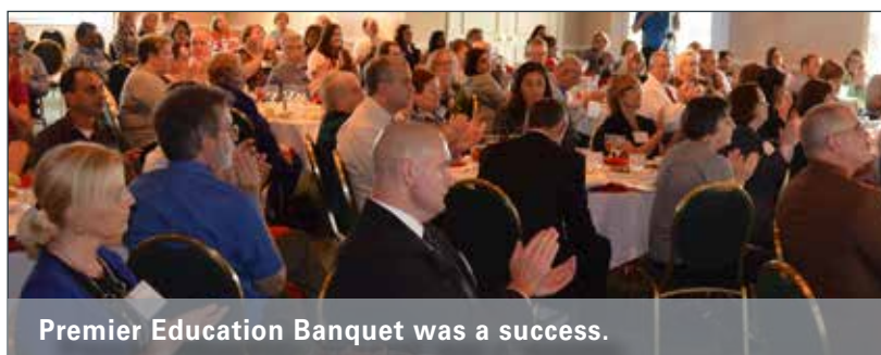
Premier Education Banquet was a success.