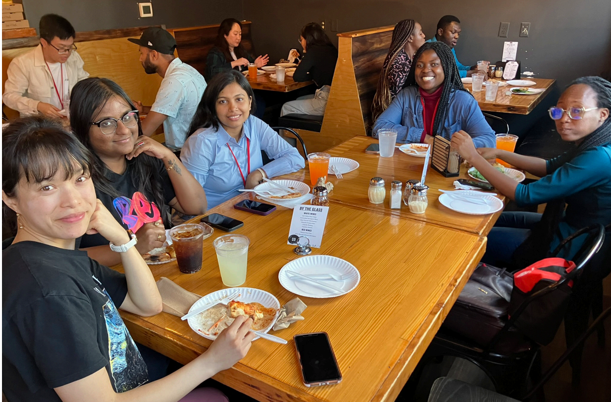
Students relax at a neighborhood restaurant after a tour of the Wigton Heritage Center

From 17 academic health sciences programs