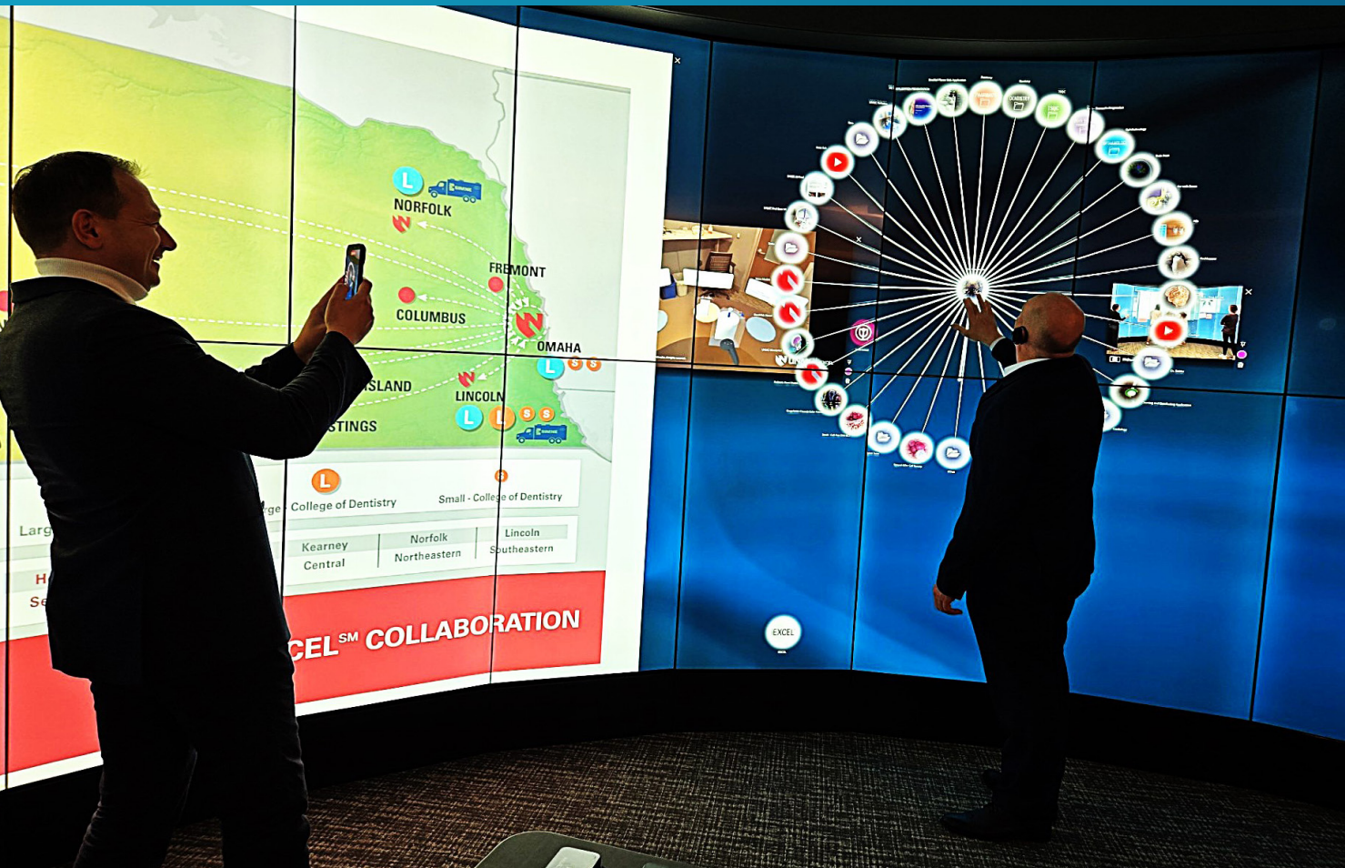
Ukraine surgeons tour iEXCEL and learn to use the interactive wall.