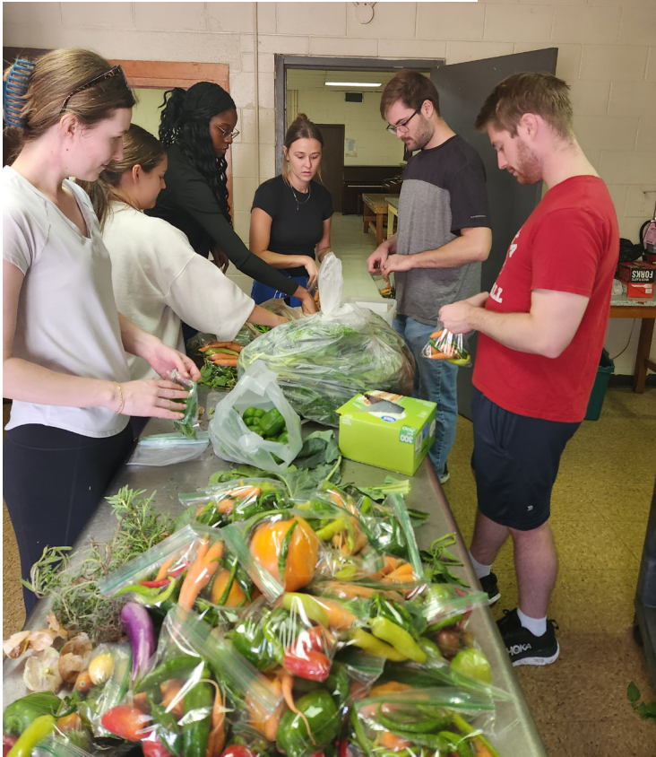
UNMC students bag vegetables for the food pantry at Clair United Methodist Church.

March 2026 spring break weeks. Twenty-two students from the colleges of allied health, medicine and nursing will assist the staff of Floating Doctors, a non-profit organization, to deliver health care by boat to 30+ island communities that are not accessible by road and have little access to health care.