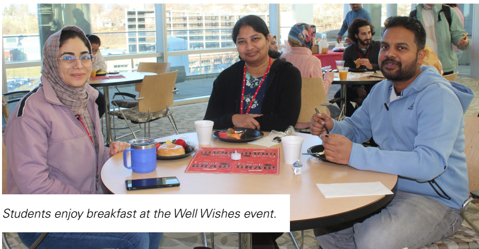
Students enjoy breakfast at the Well Wishes event.