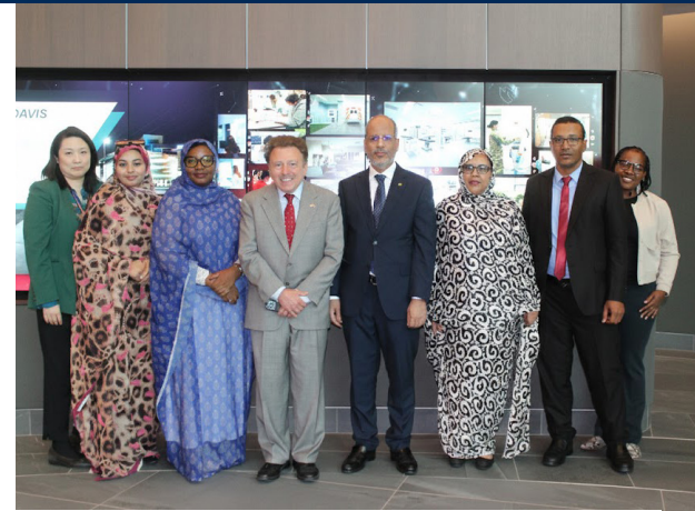
A delegation including Minister of Professional Development, Handicrafts, and Vocations; the Ambassador to Mauritana and his delegation tour the Global Center for Health Security.

The successful visit by the University of Anáhuac delegation reaffirmed the strong partnership between our institutions and sets an exciting stage for deeper collaboration.