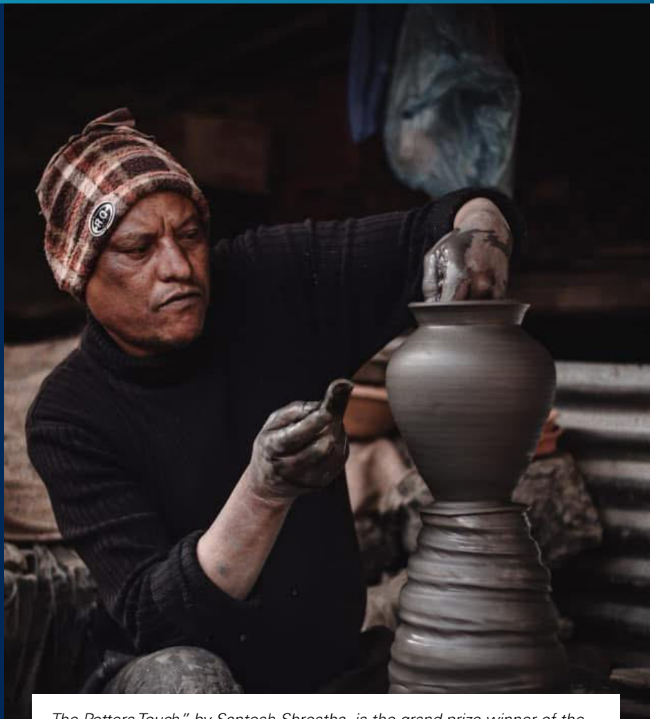
The Potters Touch," by Santosh Shrestha, is the grand prize winner of the Fifth Annual International Photo Contest.