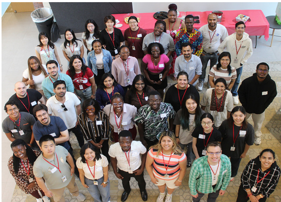
Students gather for the Fall 2024 International Student Orientation.

This year's orientation was further enhanced by seven Global Ambassadors who served as formal Orientation Ambassadors, offering their expertise through student panels and direct peer support.