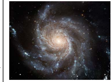
Figure 1: Giant spiral galaxy. This image taken with the Hubble Space Telescope Wide Field and Planetary Camera shows galaxy M101, which is estimated to contain at least 1 trillion stars (previously published in ref. 89).

O Both the figure and its accompanying legend should be inserted within a single text box delineated by a thin black or grey line. (Do not simply draw a rectangle around the figure and its legend! Copy/paste the figure into a text box and type the legend within the same text box.) This will vastly facilitate editing of the