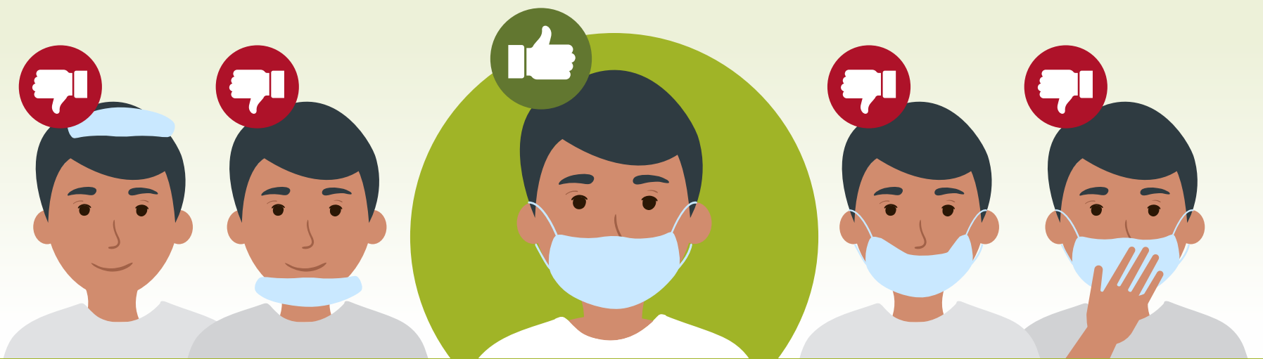
I practice good mask wearing.