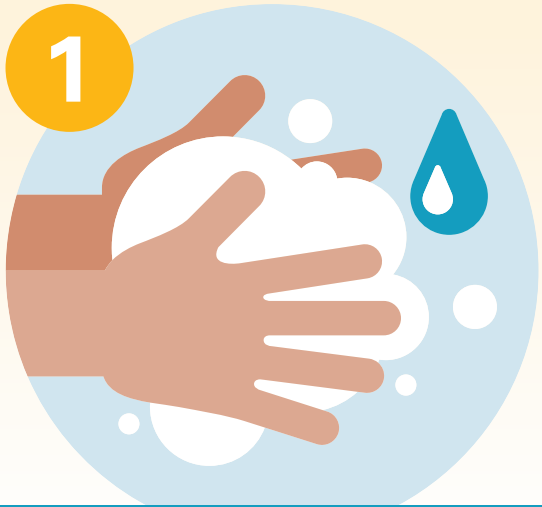
I wash or sanitize my hands.