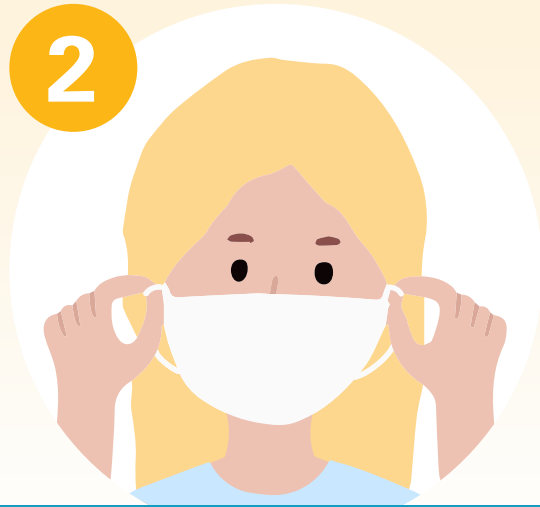
I put on my mask.