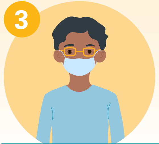
I don't touch my mask.