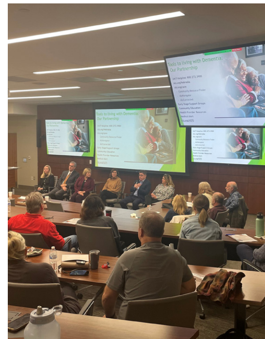
Below: Panel discussion.