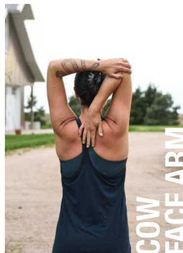
COW FACE ARM

*Hips *Knees *Back *Shoulders *Neck Knees can be wider or closer together. Ease in and out of pose to warm up hips and knees. Head can relax onto ground or onto hands. Arms can be wherever is most comfortable.