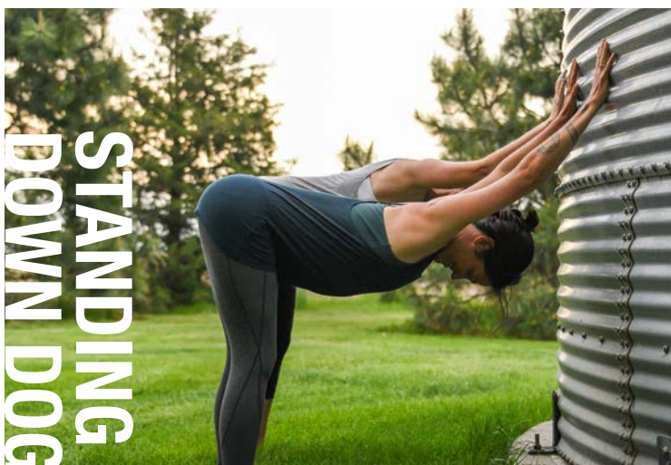
STANDING DOWN DOG

*Triceps *Shoulders Lift one arm straight up, then bend elbow so hand comes behind the head, grab the elbow with other hand and gently increase stretch to comfort level.