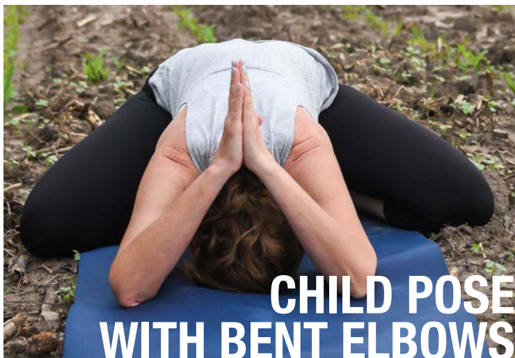
CHILD POSE WITH BENT ELBOWS

*Shoulders *Upper Back Cross arms at elbows, bring backs of hands together. If shoulders are flexible enough, you may be able to wrap arms around so palms of hands can come together. Experiment with lifting elbows and moving hands away from face to deepen stretch between shoulder blades.