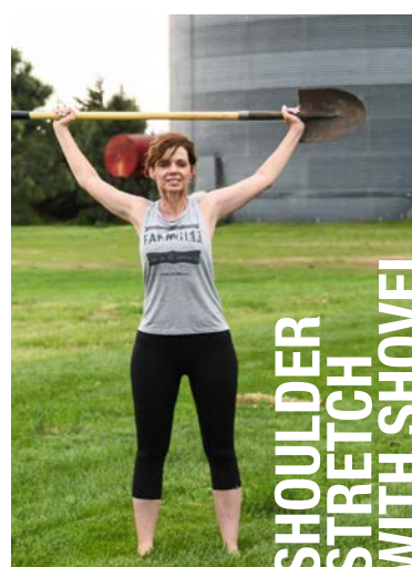
SHOULDER STRETCH WITH SHOVEL

*Hips *Hip Flexors *Calves *Heels *Feet Make sure front knee stays directly over ankle (should be able to see toes). Back heel stays lifted. Use a garden tool to help with balance or practice next to a chair or wall for support.