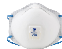
P95 Filtering Facepiece Respirator