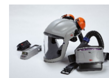
Powered Air Purifying Respirator