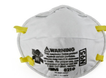
N95 Filtering Facepiece Respirators