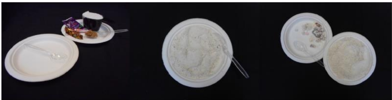
Examples of “Pathogen Packages.”