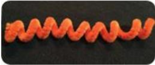
Model of Zoonotic Bacteria – Spirochete

We will now make what is called a spirochete bacterium. Take the single full-length pipe cleaner and wrap it around the pencil (or the similar-shaped object that you gave them). Then slide the pipe cleaner off of the object. (See photo below.) This represents a spirochete bacterium. It is long, can coil and tends to be flexible. This is another commonly found shape of bacteria. Borrelia burgdorferi is one of the largest concerns as it causes Lyme disease.