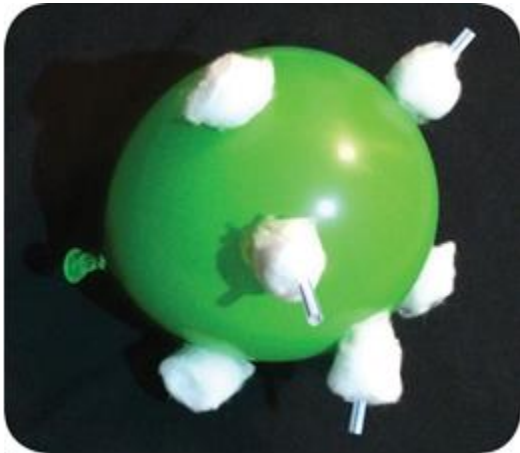
Model of Virus

18. Once the viruses are complete, ask participants what they think each of the following items represent: