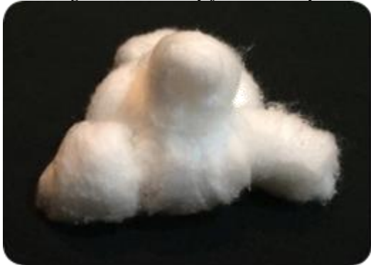
Model of Zoonotic Bacteria – Cocci

Next, we will make our second bacteria called cocci (Kok-sigh) bacteria. For this, use your cotton balls and double-sided tape/photo squares. Use the tape/photo squares to stick the cotton balls together into any formation you want. (See photo below.)