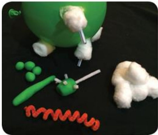
Models of the Three Main Pathogen Types (Bacteria, Viruses and Parasites)