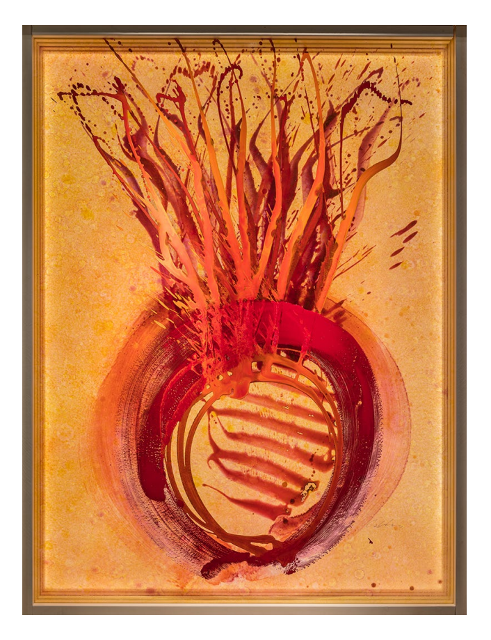
Ikebana Glass on Glass Painting, 2017, 40 x 30"