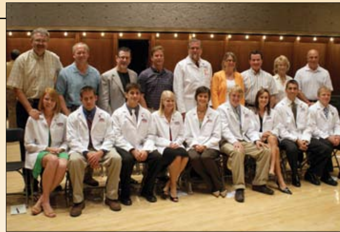
Proud medical alumni are pictured with their Class of 2012 sons and daughters at the College of Medicine White Coat Ceremony.

Springfield, Ill., is serving his residency at UNMC.